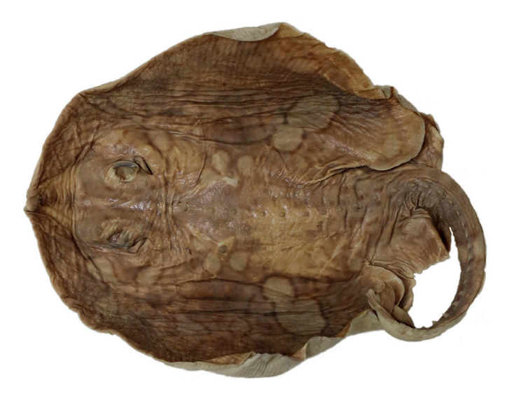
Figure 2 - Raja magellanica Steindachner, 1903. ZMB 16287, syntype 1, female, approx. 46.5 cm.