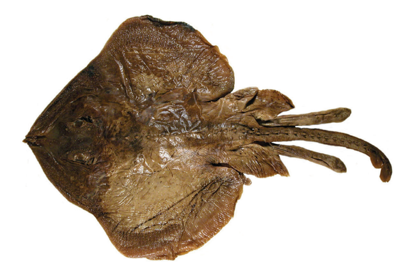
Figure 1 - Raja magellanica Steindachner, 1903. NMW 2070, syntype 2, male, approx. 60 cm.

specimens, a female and a male, collected at Punta Arenas in the Strait of Magellan, Chile. Just as Philippi he did not use a term as 'type', nor did he exclude either specimen from consideration. Thus, both