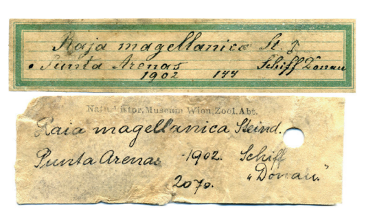
Figure 5-6 - Old labels of NMW 2070, indicating the 'ship Donau' and '1902'.

Steindachner started the description of the male syntype by informing that the Vienna museum held a second specimen from the same locality. In fact, for this one he did not mention Plate as a collector, nor did he provide any information that this specimen is not related to the title of his publication on Plate's collection. The old labels of NMW 2070 (Figures 5-6) indicate