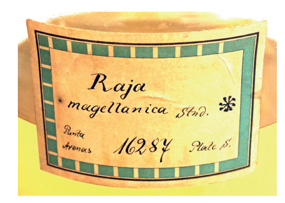
Figure 4 - Original label on jar of ZMB 16287.

With catalog data referring to Ludwig Plate as collector, to Punta Arenas as locality (Figure 4), and a collection number that fits perfectly among the further specimens examined by Steindachner for his 1903 addendum on Plate's fishes from Chile (table